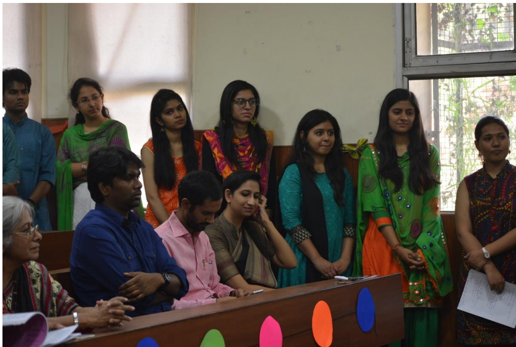
Keen and Active Participation by Faculty and Students of Biological Sciences during the Event